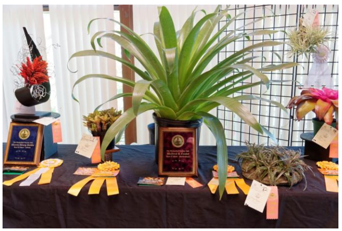
Terrie Bert's Best in Show, Horticulture